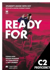
TABLE OF CONTENTS: READY FOR C2.2