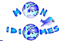
TABLE OF CONTENTS: NEW HIGH FIVE 2